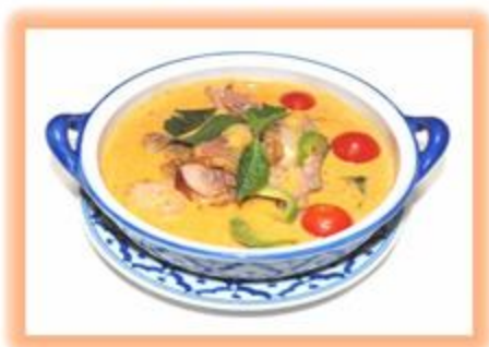
C 8. GANG PED PET YANG $23.95

Shrimp with red curry, coconut milk, bell pepper, pineapple, markroot and basil.