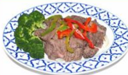
E 18. RUANG THAI STEAK $23.95 Beef (Flank Steak), bell pepper, onion, broccoli with Chef's Specials sauce.