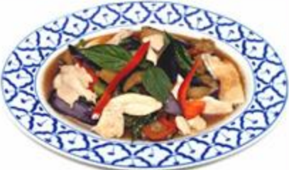
E 9. PAD MA KYA (Eggplant) $16.95 Eggplant, bell pepper and basil.