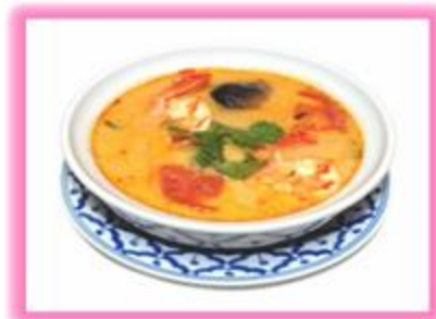
S 5. RUANG THAI SOUP $18.95 Shrimp, lemon grass, straw mushroom, tomatoes, onion and cilantro with Chef's Specials sauce. (Small $9.00)