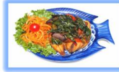
SF 4. PLA BASIL $27.95 Fish fillets with red curry, eggplant, bell pepper, markroot, kachai and basil. (Whole fish $49.95)