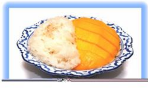
D 6. STICKY RICE WITH MANGO $10.95