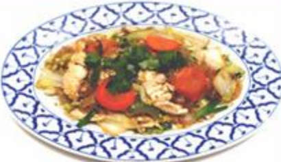
E 5. PAD WOON SEN $16.95 Bean thread, egg, carrot, napa, celery, green onion and cilantro.