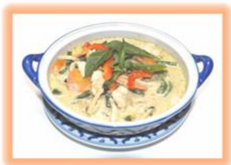
C 1. GREEN CURRY $19.95 Green curry, coconut milk, bell pepper, carrot, bamboo shoot, green bean and basil.

Combination or Shrimp add $4.00 Seafood add $6.00