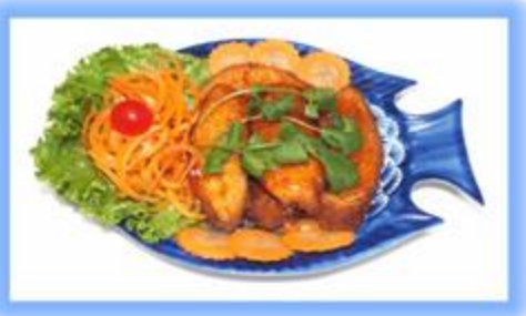
SF 3. PLA SAM ROD $27.95 Fish fillets with specials sauce (sweet, sour, salty) and basil. (Whole fish $49.95)