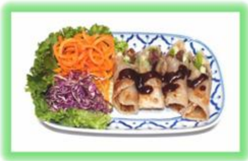
A 3. RUANG THAI DUCK ROLL $13.95