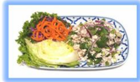
SL 4. LARB GAI $16.95 Broiled chicken, crushed rice, mint, green onion, red onion, cilantro and lime juice.