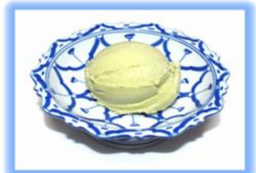
D 2. GREEN TEA ICE CREAM $7.95