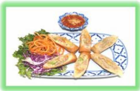
A 1. CRISPY EGG ROLL ( VEG. ) $8.95