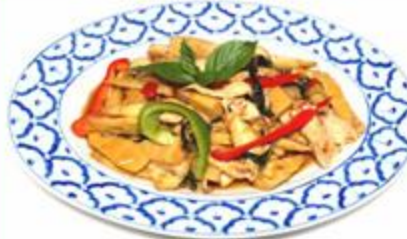
E 10. PAD GAI NOR MAI (Bamboo) $16.95 Bamboo Shoot, bell pepper and basil.