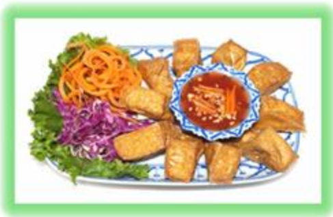
A 5. FRIED TOFU $9.95