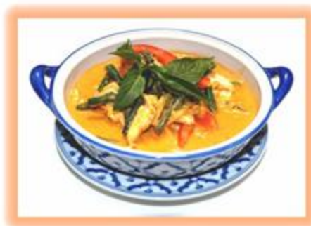
C 2. RED CURRY $19.95 Red curry, coconut milk, bell pepper, carrot, bamboo shoot, green bean and basil.