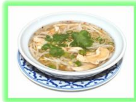
N 6. KUA TIAO TOM YUM $16.95 Rice noodle soup with bean sprout, garlic, green onion, and cilantro.