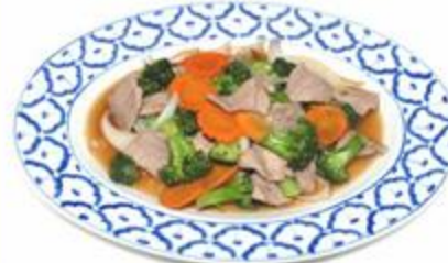
E 12. PAD BEEF BROCCOLI $16.95 Beef with broccoli, carrot and onion.