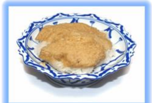
D 4. STICKY RICE WITH EGG CUSTARD $8.95