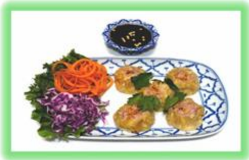
A 7. STEAMED PORK DUMPLING $11.95