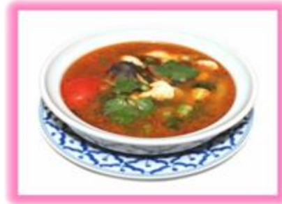
S 2. TOM YAM $15.95 Chili paste soup with lemon grass, straw mushroom, tomatoes, onion and cilantro. (Small $7.50)