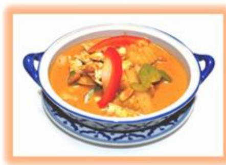
C 4. MASSAMUN CURRY $19.95 Massamun curry, coconut milk, bell pepper, potato, onion and peanut.