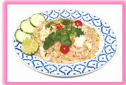
R 4. THAI FRIED RICE $16.95 Egg, carrot, onion, tomatoes, cucumber and cilantro.