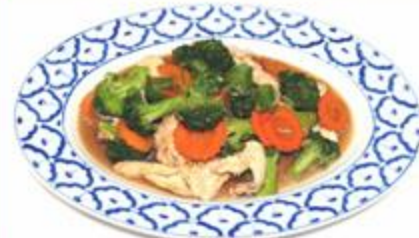
E 2. PAD GRA TIEM PRIK THAI $16.95 Broccoli, carrot, garlic, black pepper and cilantro.