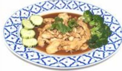
E 14. GAI WAHN $17.95 Chicken with sweet sauce, garlic, broccoli, cucumber and cilantro.