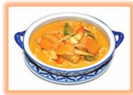
C 5. GANG KA REE $19.95 Ka ree curry, coconut milk, bell pepper, potato, onion and carrot.