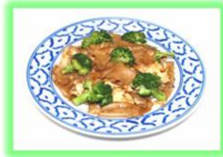
N 2. PAD SEE EAW $16.95 Flat noodle with egg and broccoli.