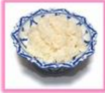
R 3. STICKY RICE $5.00