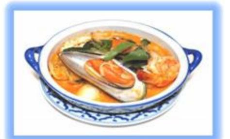
SF 5. HOO MOK TALAY $27.95 Seafood with Red curry, bell pepper, napa, markroot and basil.