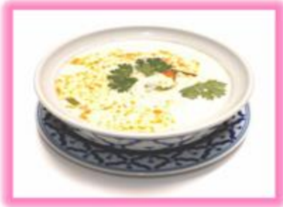
S 1. TOM KHA $15.95 Coconut milk soup with lemon grass, straw mushroom, onion and cilantro. (Small $7.50)

Your choice of chicken, beef, pork or tofu. Shrimp add $4.00 Seafood add $6.00