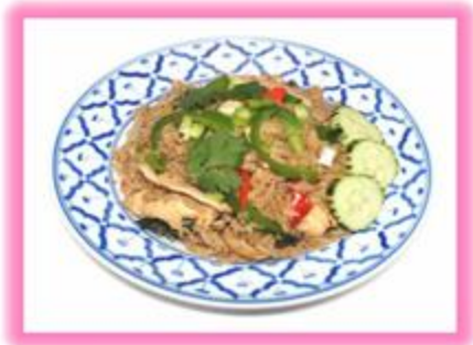
R 5. THAI SPICY FRIED RICE $16.95 Bell pepper, mushroom, bamboo shoot, basil, onion, cucumber and cilantro.