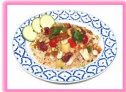
R 6. PINEAPPLE FRIED RICE $16.95 Egg, Pineapple, cashew nut, carrot, onion, cucumber, cilantro.