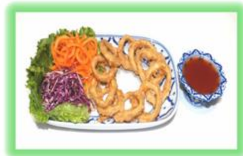
A 12. CRISPY FRIED SQUID $13.95