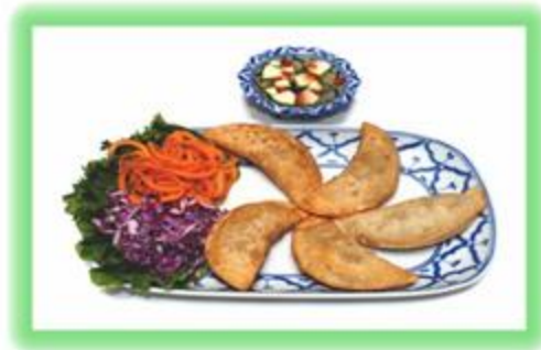
A 6. CHICKEN CURRY PUFFS $11.95