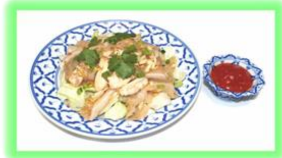
N 4. KUA TIAO KUA GAI $16.95 Flat noodle with chicken, egg, lettuce, green onion, cilantro and special sauce.