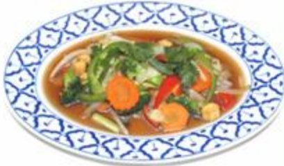
E 13. PAD PAK RUAMMIT (Vegetarian) $16.95 Broccoli, carrot, onion, celery, zucchini, mushroom, cabbage and Tofu.

Served with steamed rice. Your choice of chicken, beef, pork or tofu. Combination or Shrimp add $4.00 Seafood add $6.00