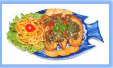
SF 1. PLA RAD PRIK (MAESUREE) $27.95 Fish fillets with jalapino, onion, garlic, basil (very spicy sauce). (Whole fish $49.95)

Served with steamed rice. (Fillets have Tilapia) (Whole fish have Red Snapper)