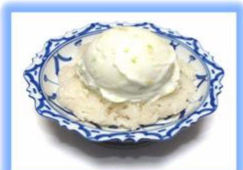
D 5. STICKY RICE WITH ICE CREAM $10.95