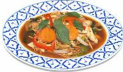
E 15. PAD NAM PRIK POW $17.95 Chili paste, bell pepper, carrot, onion, mushroom, bamboo shoot and basil.