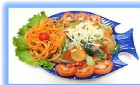
SF 6. RUANG THAI GINGER FISH $27.95 Fish fillets with ginger, bell pepper, carrot, onion, mushroom, celery and with Chef's specials sauce. (Whole fish $49.95)