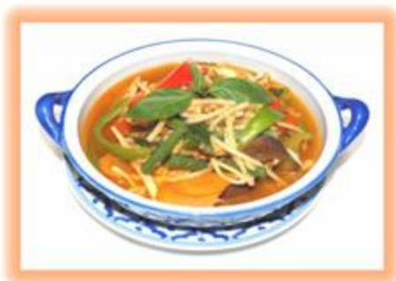
C 6. GANG PAH $19.95

Combination or Shrimp add $4.00 Seafood add $6.00