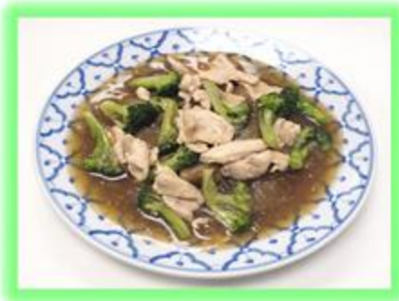
N 5. LAD NA $16.95 Flat noodle with broccoli and Thai gravy.