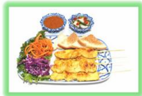
A 10. SATAY ( Chicken ) $13.95