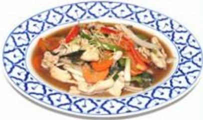
E 7. PAD TA KRAI (Lemon grass) $16.95 Lemon grass, bell pepper, carrot, onion, mushroom, and basil.

Served with steamed rice. Your choice of chicken, beef, pork or tofu. Combination or Shrimp add $4.00 Seafood add $6.00