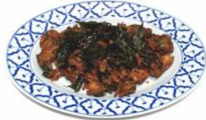
E 16. GAI GROB HORAPA $20.95 Crispy chicken, lemon grass and basil.