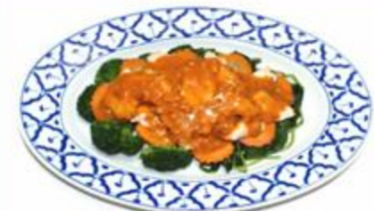
E 6. PAD PRA RAM $16.95 Spinach, carrot, broccoli, and peanut sauce.