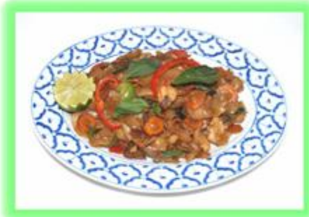
N 3. PAD KEE MAO $16.95 Flat noodle with carrot, bell pepper, tomatoes and basil.