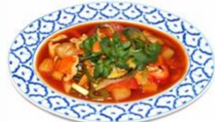
E 4. PAD PREW WAN $16.95 Sweet & sour sauce with pineapple, bell pepper, carrot, onion, celery, cabbage, cilantro.