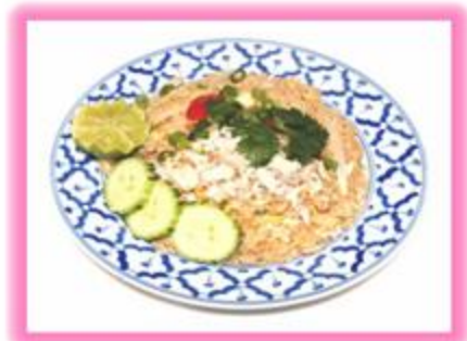
R 8. CRAB FRIED RICE $20.95 Crab, egg, carrot, onion, tomatoes, cucumber and cilantro.