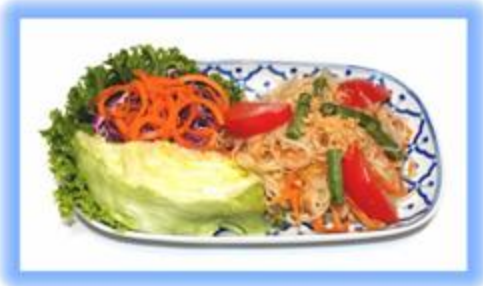
SL 3. SOM TUM (Papaya salad) $16.95 (Peanut or Salt crab) Peanut or Salt crab with papaya, green bean, tomatoes and lime juice.