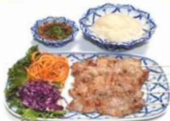
E 17. THAI B.B.Q. $20.95 Grilled pork with thai chili sauce and served with sticky rice.