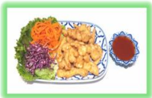
A 11. CRISPY FRIED CHICKEN $13.95