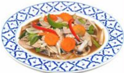
E 11. PAD PEPPER BEEF $16.95 Beef with bell pepper, carrot, onion and mushroom.