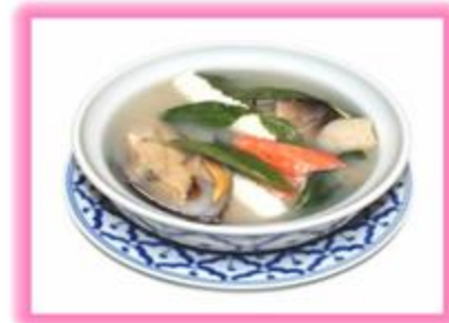
S 4. PAO TEAK $20.95 Shrimp, crabmeat, mussel shell, fish ball, scallop and squid, straw mushroom, basil. (Small $10.00)