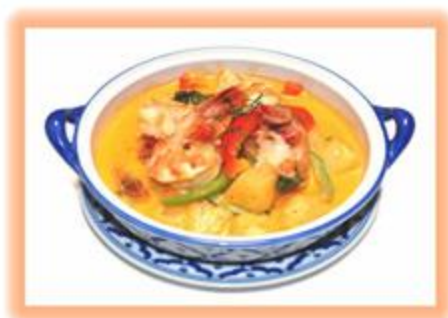
C 7. GANG SUP PA ROD $23.95

Gang pah curry, bell pepper, carrot, green bean, bamboo, cabbage, young pepper, kachai, basil.