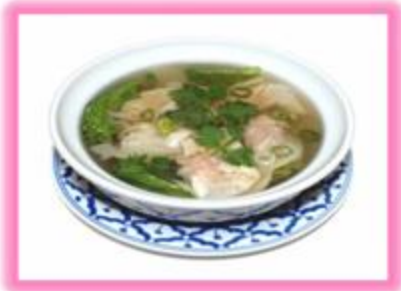
S 3. KIAO NUM $15.95 Shrimp wonton with noodle, green leaf, green onion, garlic and cilantro.