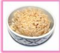
R 2. BROWN RICE $5.00