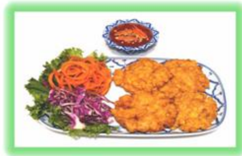
A 4. CORN FRITTERS $9.95