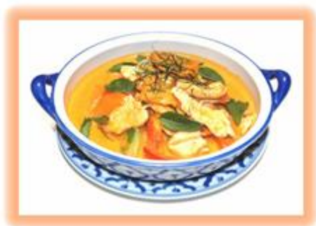
C 3. PANANG $19.95 Panang curry, coconut milk, bell pepper, carrot, markroot and basil.