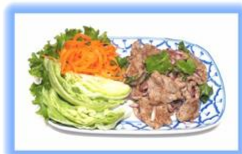
SL 5. NUA NUM TOK $16.95 Grilled beef, crushed rice, mint, green onion, red onion, cilantro and lime juice.