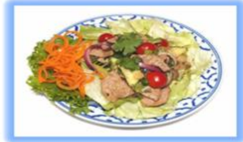
SL 2. YAM NUA $16.95 Stir-fried beef, lettuce, onion, tomatoes, mint, cucumber, cilantro and lime juice.