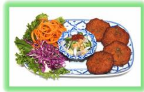
A 8. TOD MAN ( Fish ) $11.95