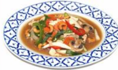
E 8. PAD HIM MA PAN (Cashew nut) $16.95 Cashew nut, bell pepper, carrot, onion, mushroom and celery.