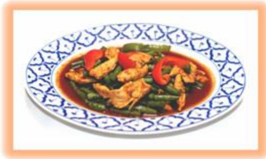
C 10. PAD PRIK KING $19.95

Red curry, bell pepper, green bean, eggplant, young pepper, kachai and basil.