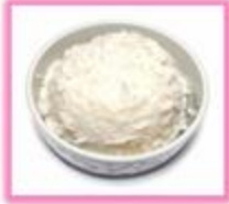
R 1. STEAMED RICE $3.00

Your choice of chicken, beef, pork or tofu. Combination or Shrimp add $4.00 Seafood add $6.00