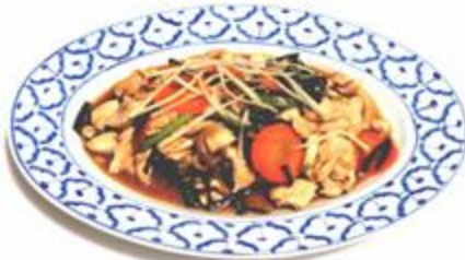
E 1. PAD KING $16.95 Ginger, bell pepper, carrot, onion, mushroom and celery.

Served with steamed rice. Your choice of chicken, beef, pork or tofu. Combination or Shrimp add $4.00 Seafood add $6.00