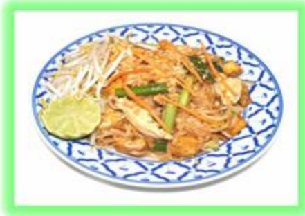
N 1. PAD THAI $16.95 Rice noodle with egg, carrot, green onion, bean sprout and peanut.

Your choice of chicken, beef, pork or vegetable & tofu. Combination or Shrimp add $4.00 . Seafood add $6.00