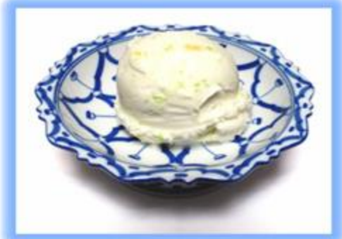
D 1. COCONUT ICE CREAM $7.95