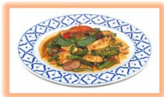
C 9. PAD PED $19.95

Roasted duck with red curry, coconut milk, tomatoes, bell pepper, pineapple, lichee, markroot and basil.