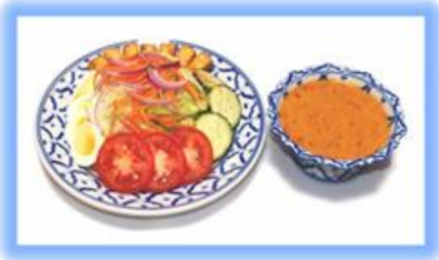
SL 1. THAI SALAD $15.95 Lettuce, carrot, cucumber, tomatoes, broiled egg, tofu and peanut sauce.