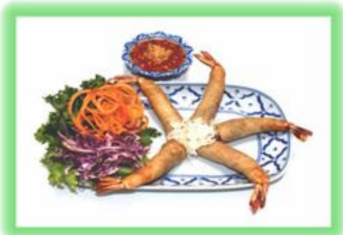
A 9. GOONG HOM PHA $11.95