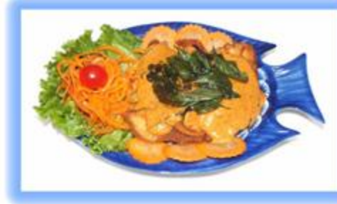
SF 2. PLA CHU CHEE $27.95 Fish fillets with red curry, markroot and basil. (Whole fish $49.95)