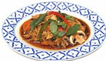
E 3. PAD BAI KA POW $16.95 Bell pepper, carrot, mushroom, zucchini, bamboo shoot and basil.