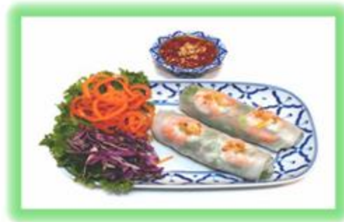
A 2. SOFT SHRIMP ROLL $8.95