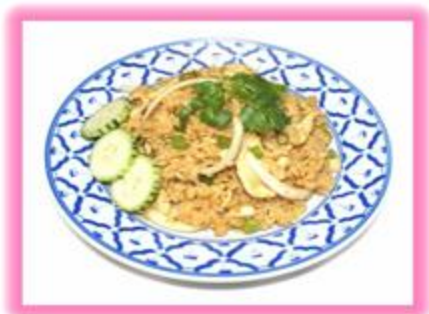
R 7. CURRY FRIED RICE $16.95 Yellow curry, potato, onion, cucumber and cilantro.